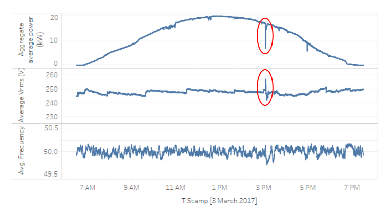
Figure 3 Aggregate solar PV response to event (top), average local voltage (middle), average local frequency (bottom)

The second event occurred in Victoria on 18 January 2018, when the loss of solar PV similarly exacerbated conditions. Notably, preliminary analysis has indicated that the response of PV inverters was centred in Melbourne, whereas in the South Australian case there was disconnection observed across the state.